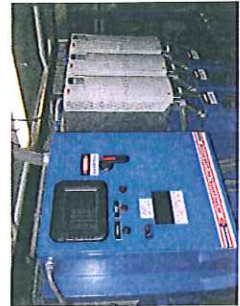
Variable Speed Booster System